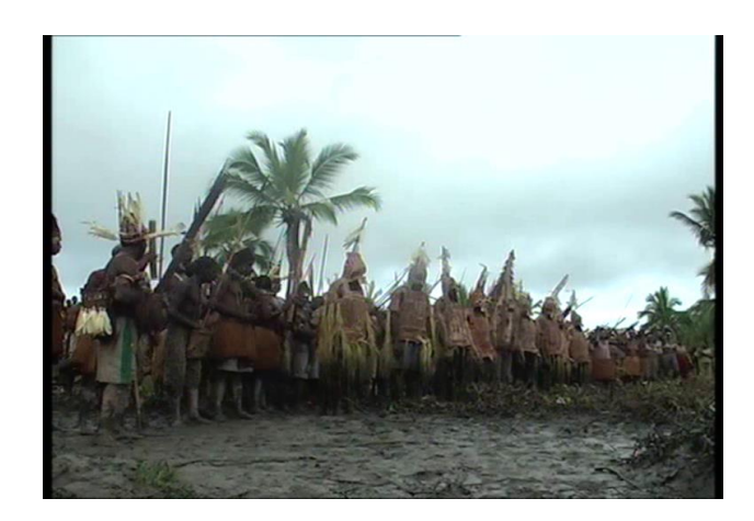
Figure 2 : Scene of farewell to the setan by the Biapis villagers.

the setan objects such as sanapi sticks from wood, mud, wheat, gepe-gepe , Then there is playing catch by the children chased by the setan. The closing scene of Ipai is the letting go of the Spirit with a farewell speech and mantra chanted by one person trusted by the chief of the Biapis village, and chosen to be the next chief. The other dancers stand in a straight line with community spectators behind the demon.